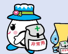
Hakusan Tedorigawa Geopark Mascots Yuki Mama & Shizuku-chan

This is an evacuation site for quickly escaping danger in the event a disaster occurs or is likely to occur.